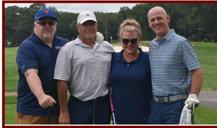
2023 WINNING FOURSOME